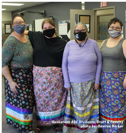
Saskatoon ABE Students, Staff & Faculty

before and after starting this venture which for many students was also a new learning opportunity. The material was purchased from Century Fabric and the ribbon from Twig & Squirrel. Both local stores provided a discount to DTI.