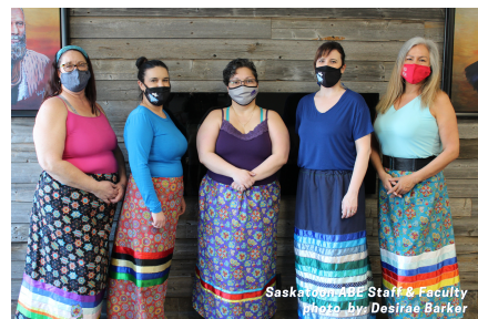
Saskatoon ABE Staff & Faculty

The week finished on a positive note and students commented that they will pass along the teachings they learned to their friends and family. DTI Saskatoon ABE staff and faculty are already planning more projects which will showcase Métis culture and celebration for the end of this semester in June. 🌍