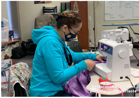
Saskatoon ABE Student

Last month, the Dumont Technical Institute (DTI) Saskatoon Adult Basic Education (ABE) staff and faculty took on a new venture to help connect students with Métis culture.